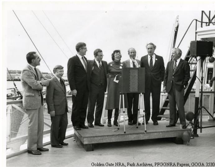
Golden Gate NRA, Park Archives, PFGNRA Papers, GOGA 35304